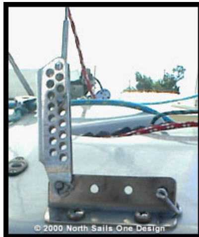
Figure1 - Shroud position.

Spreader of the mast to most boats this spreader affects stepping the mast front side of the the deck to the bending to