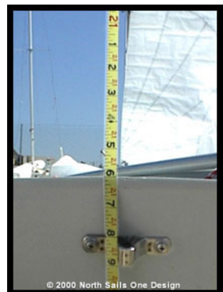
Figure 3 - Mast rake measured to intersection of transom and aft deck.