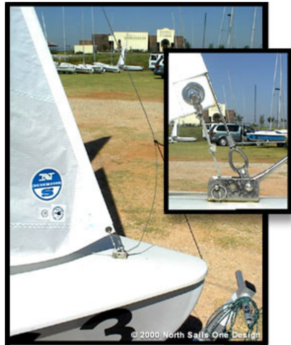
Figure 2 - Jib tack location, all the way forward

Below is a chart of the three different settings we use. All measure to the top of the transom.